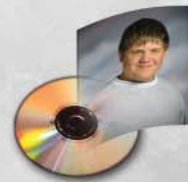
Image on CD & Unlimited Copyright Release